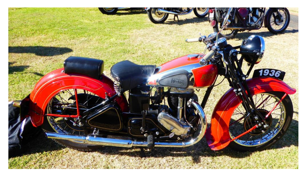
A category winning Rudge at the Grafton Rally.