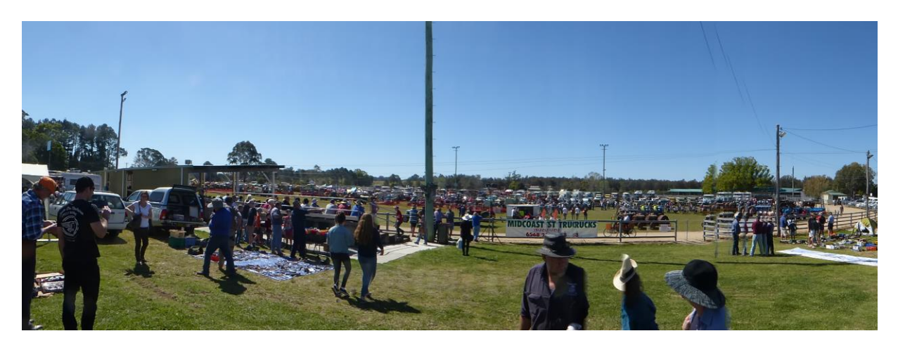
Panorama of the Rusty Iron Rally on Saturday Morning

The lunch spot, Brushgrove Pub on the Clarence Valley Club's Grafton Rally,